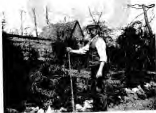
(c) JOHN ENGLAND [see p. 33]